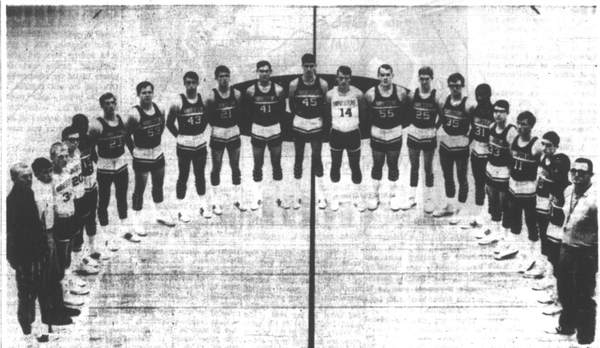
THE HARVESTERS 1968-69 —Pampa's High School basketball team for the coming season held picture day Monday at the field house. The Harvesters open the coming season Dec. 3 at Perryton.