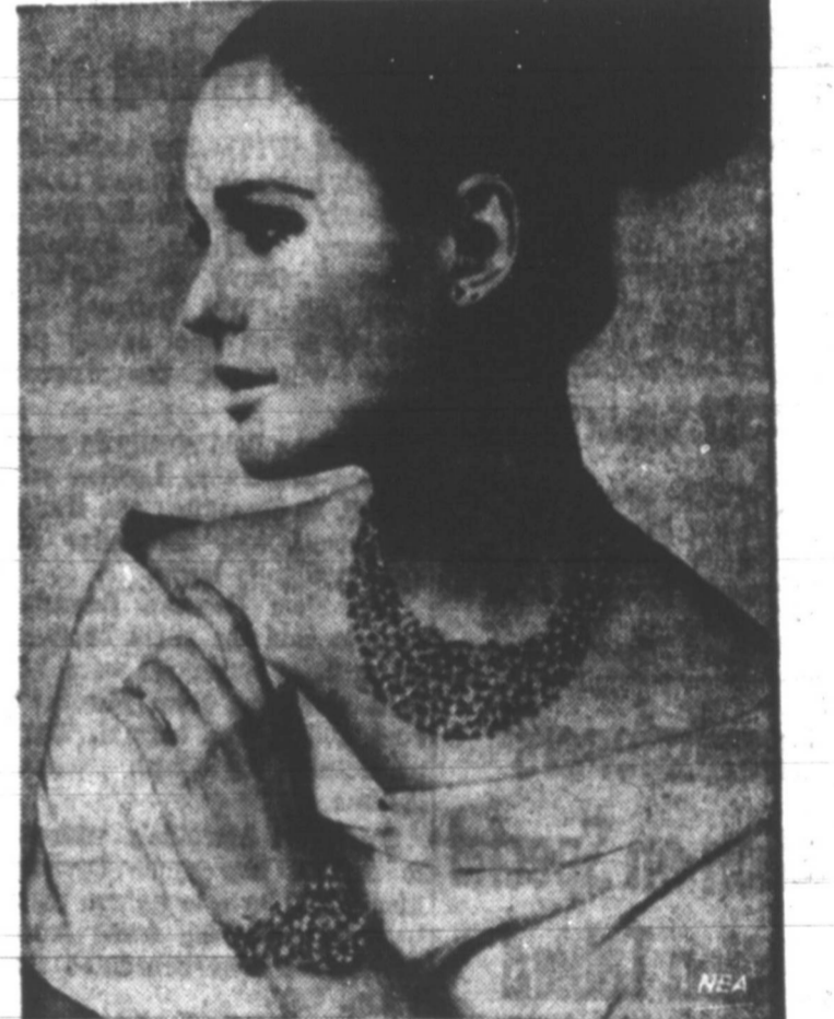
THE MATCHED-SET NECKLACE and watch bracelet is in a lacework of platinum, magnificent round diamonds and marquise-cut emeralds. A tiny, precision-tooled watch is in the center of the bracelet.