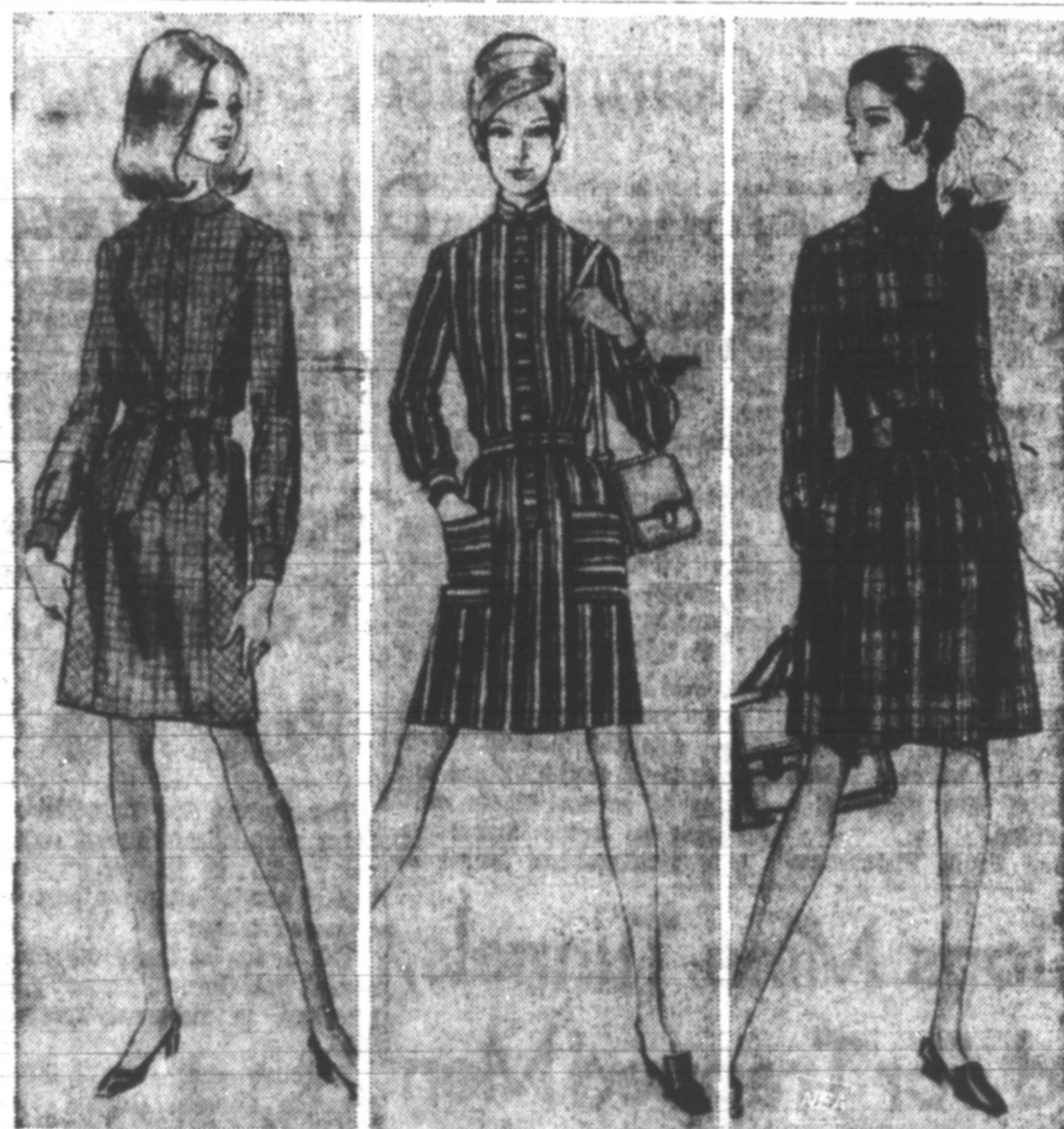
THE BELT IS BACK IN STYLE and offers a great look when teamed with a maxi-shirt. Dacron and cotton shirt (left) has Bermuda collar, shaped body and tie belt. Arnel and cotton shirt (center) has rojoh collar and 2 1/2-inch patent belt. Fortrel and cotton shirt (right) with long boy sleeves also has wide patent belt.