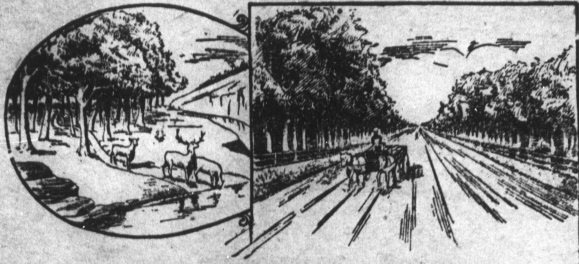
PRIMITIVE AND MODERN HIGHWAYS.

Improved public highways are the foremost agents of modern progress and prosperity and are as important to commerce as veins are to the body.