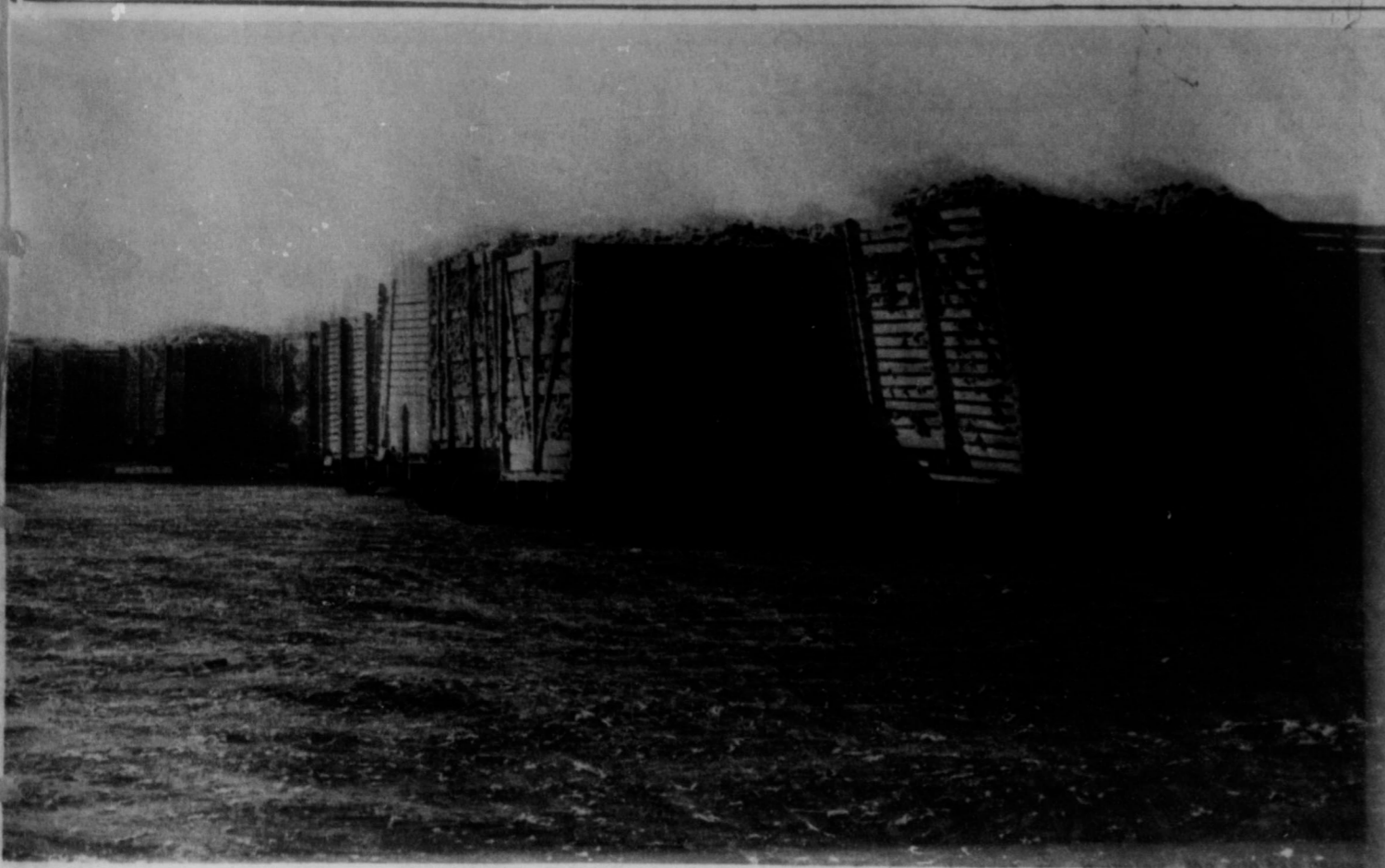
COTTON PILES UP AT GINS . . . With a week of dry weather, the cotton farmers have been harvesting cotton at full speed. Thus the pile-up pictured at the Progress Gin. A large number of trailers are pictured lined up and ready for processing although the weather has been cold this past week, with tempera-

tures dropping to four degrees one morning, the sun has shone most of the week. A sandstorm Tuesday brought high winds and some damage to the late feed left in the fields. There was some minor property damage also reported from the high winds and sand. Cotton harvest will continue on schedule if the weather holds out another week.