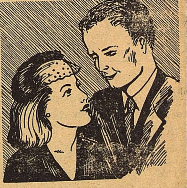
"Scram," he said. "The lady and I just got to see each other alone."