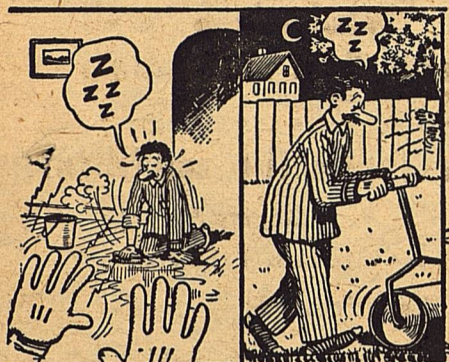
By Bud Fisher