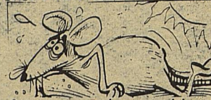
A rat can go longer without water than a camel can.