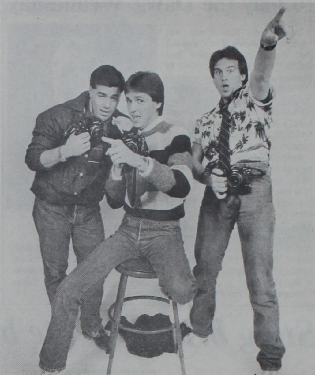
The Funny Guys