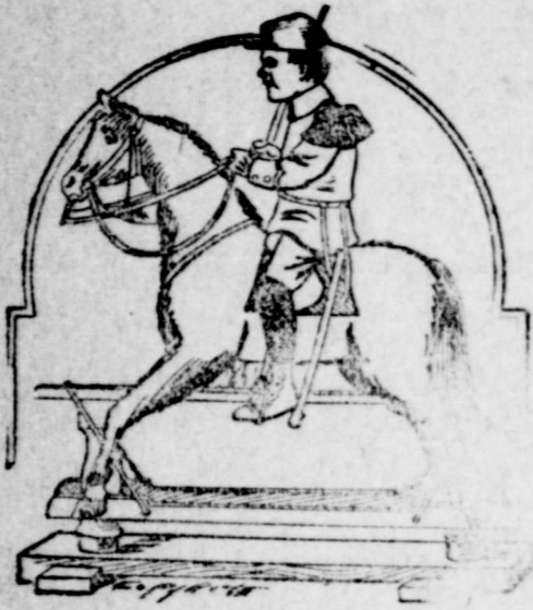
Your boy would like this horse.

My stock of Holiday Goods is large and varied and suited to the requirements of all.