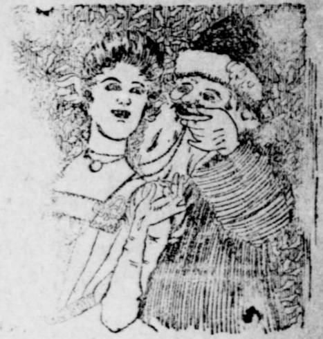
Santa Claus' headquarters are at Walkers.

Our Stock is the largest, the brightest, the newest and the cheapest. Call and see it and be convinced.