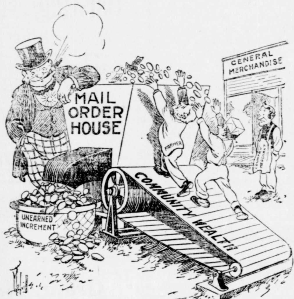
Are you operating the tread mill to pour the wealth of your community into the bottomless hoppers of the mail-order house? Are you driving your local merchants out of business? If you are you are killing your town and your own interests.

Much of the trading away from home is due to thoughtlessness and ignorance of business principles. Many persons consider only the first