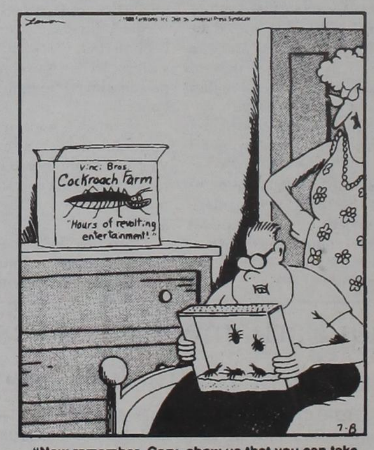
'Now remember, Cory, show us that you can take good care of these little fellows and maybe next year we'll get you that puppy."