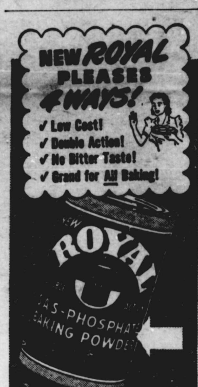
Contains No Cream of Tartar

Get ALL-BRAN at your gro-cer's. Made by Kellogg's of Battle Creek and Omaha.