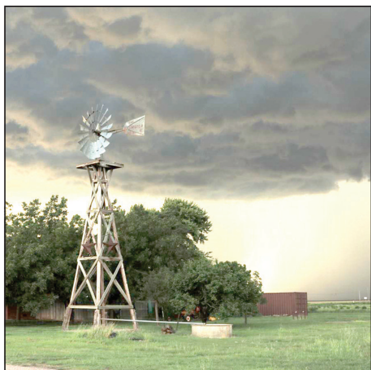
Dr. Gary Cash caught the storm clouds rolling in last week. As of Wednesday morning the area has received 10.59” of precipitation with more rain forecast later in the week.

Drivers who illegally pass school buses face fines up to $1,250 for the first offense, and potential criminal charges if they cause serious bodily injury to another. For individuals convicted of this offense more than once, the law allows the individual’s driver license to be suspended for up to six months. (A ticket for illegally passing a school bus cannot be dismissed through defensive driving.)