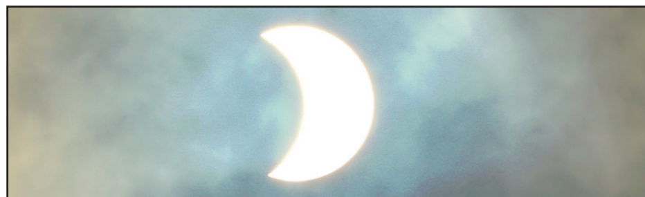
Clouds blocked the eclipse on Monday for most of the area. The clouds parted briefly and the eclipse could be seen. As the moon passed in front of the sun, these beautiful images were captured.