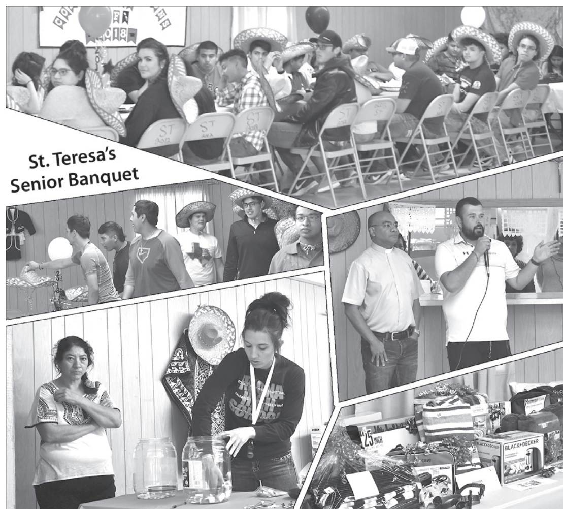
St. Teresa's Senior Banquet