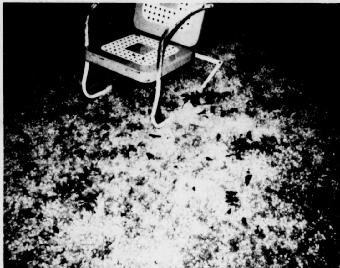
HAIL TURNS GROUND WHITE —This picture was taken about 3:20 Tuesday morning after the hail storm had subsided. This scene is a Bermuda-grass covered yard which was completely covered with the hail.