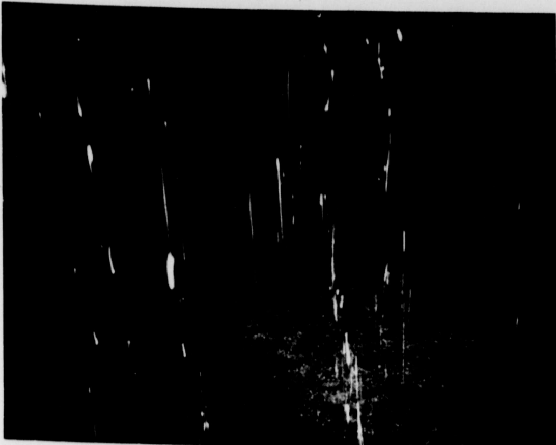
FALLING HAIL—The camera stuck out the front door during the big hail storm about 3 a.m. Tuesday caught this picture of hail falling. The hail lasted about 15 or 20 minutes.