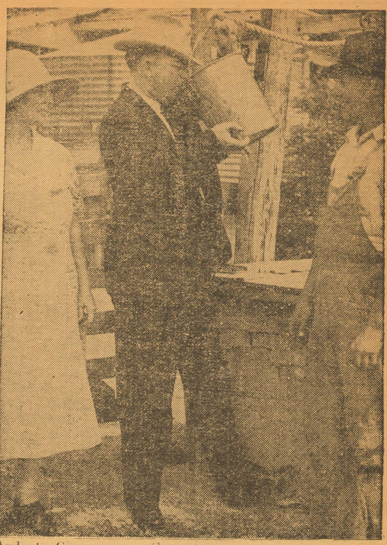
Ardent Campaigner Ernest Thompson overlooks no opportunities as he combs Texas for gubernatorial votes. He works the rural as well as the urban districts. The above snapshot