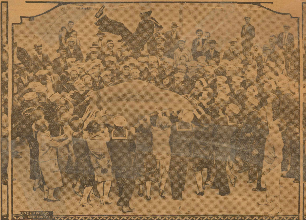
Navy day was celebrated at Long Beach, Calif., with the gobs from the Pacific fleet as the guests of the citizens. Sports of all kinds were indulged in by the sailors and their girls, one of the most amusing being the tossing of a sailor in a blanket.