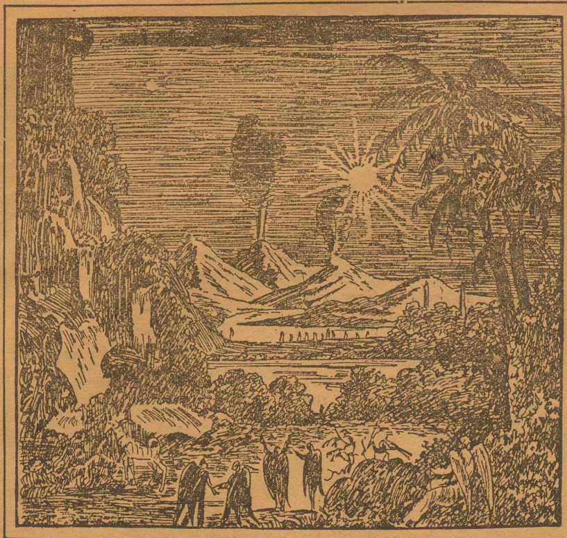
"A Scene on the Moon." Published in Connection With the New York Sun's Celebrated Hoax of 1835.

And so the New York Sun chose a very fertile field in 1835, when it began the publication of Locke's fantastic imaginings with all the seriousness of a great scientific discovery. For a time the credulous public of two continents, and even the scientists, were completely deceived. This stupendous feat brought the Sun the largest circulation in the world, and in the opinion of Edgar Allan Poe, the greatest newspaper as an