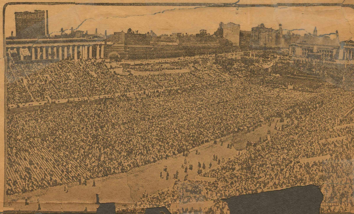
Here is a general view of the throng of 300,000 that attended the opening day of the Twenty-eighth International Eucharistic Congress in Chicago. This was the third largest throng in the history of the city.

the throng of 300,000 that attended the opening day of the Twenty-eighth International Eucharistic Congress in Chicago. This was the largest in the history of the city.