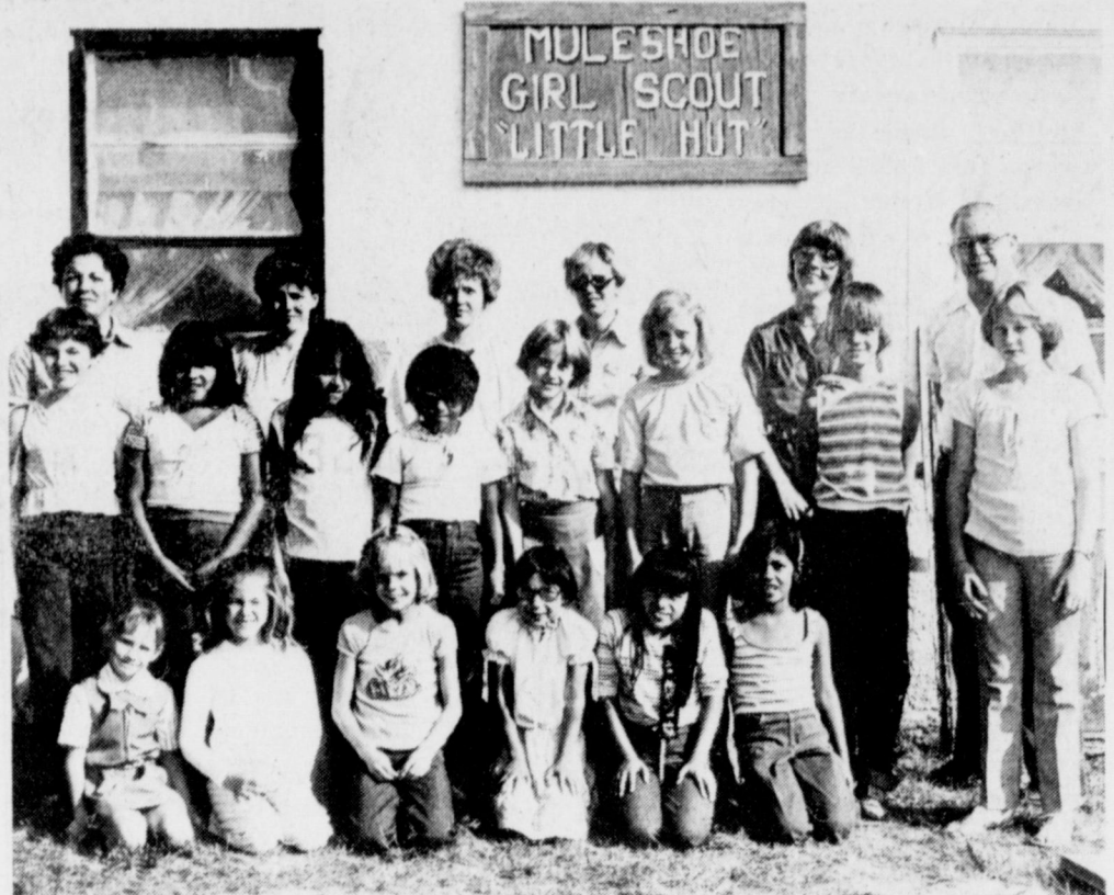
MULESHOE GIRL SCOUT LITTLE HUT