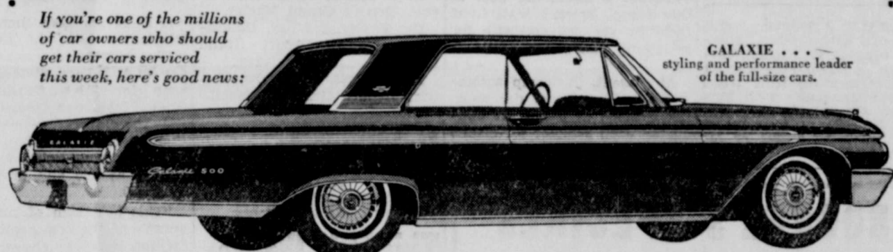
GALAXIE . . . styling and performance leader of the full-size cars.

We Invite You To Use Our Savings Department