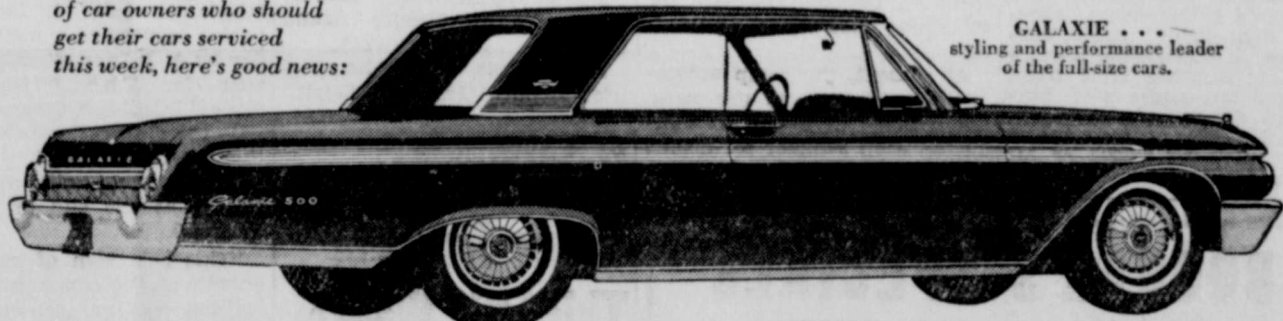
GALAXIE ... styling and performance leader of the full-size cars.

If you're one of the millions of car owners who should get their cars serviced this week, here's good news: