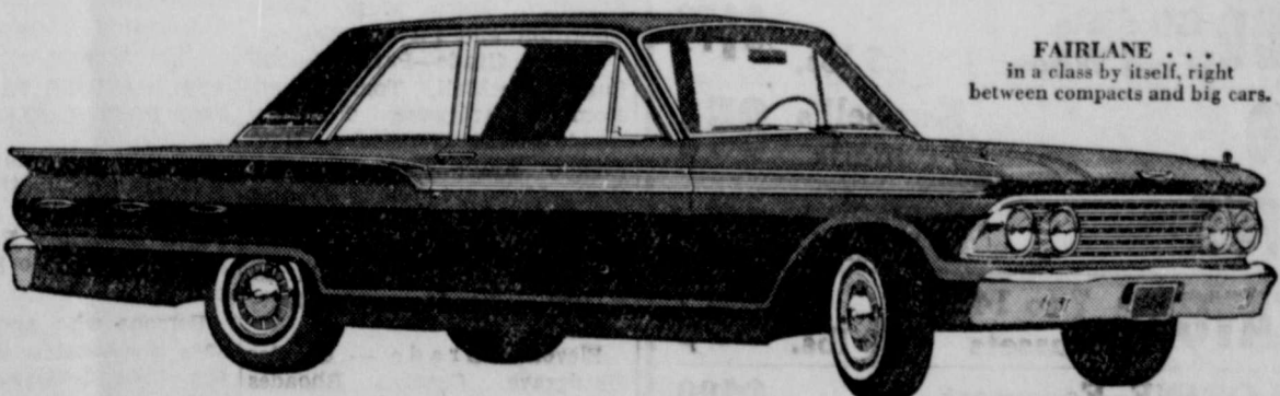
FAIRLANE ... in a class by itself, right between compacts and big cars.

Ford eliminates 10 out of 12 service stops required by most cars!