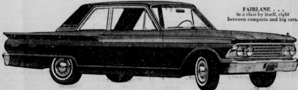
FAIRLANE . . . in a class by itself, right between compacts and big cars.

Ford eliminates 10 out of 12 service stops required by most cars!