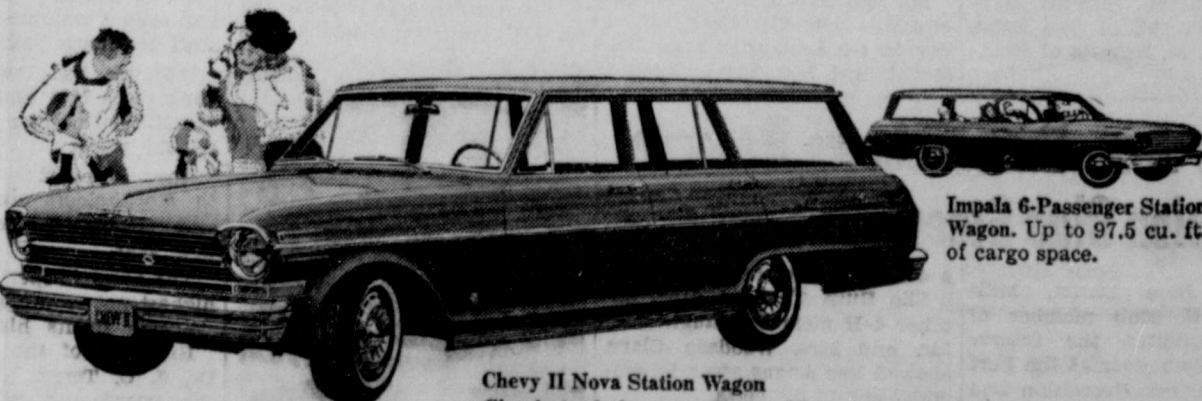
Impala 6-Passenger Station Wagon. Up to 97.5 cu. ft. of cargo space.

Chevrolet's got WAGONS by the dozen! ... in a beautiful variety of styles, sizes and prices