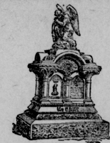
Agent for White Bronze Monuments.