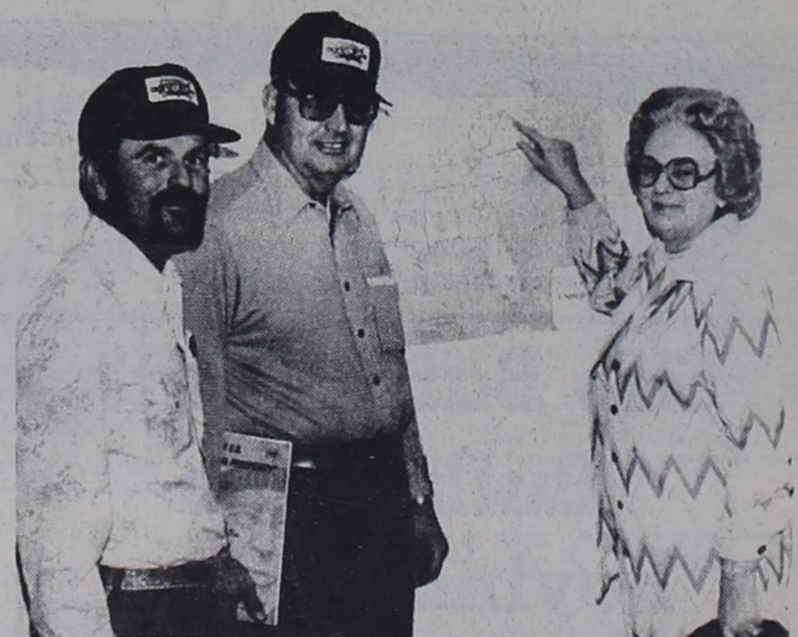
WASHINGTON BOUND....Three of the group of 14 who left on Tuesday for the second phase of the "Washington Rally" are shown