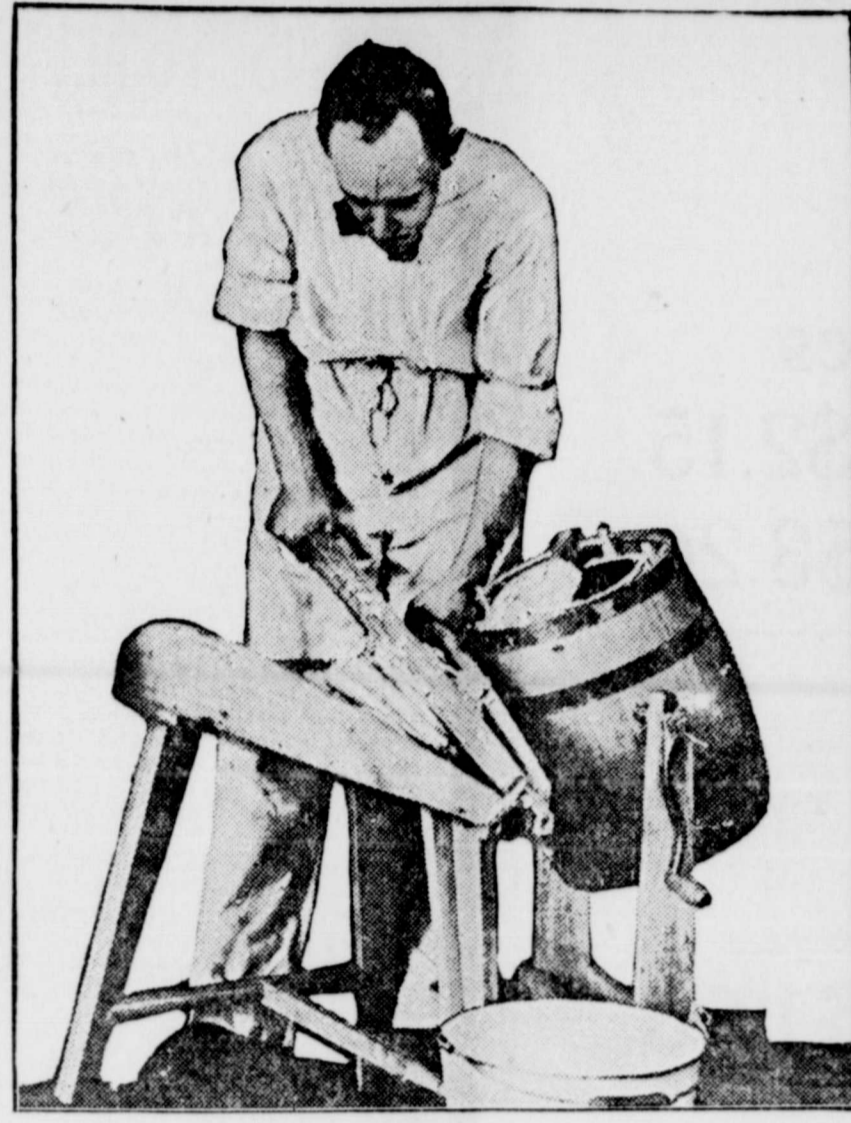
HANDY BUTTER WORKER—EASILY MADE AND OPERATED.

Sometimes butter made on the farm, particularly in winter, becomes mottled, and even though it may be a very good flavor, when put upon the market, it is strongly discriminated against by the purchaser. As this difficulty is one of workmanship, it can be overcome by the application of proper methods on the part of the butter-maker.