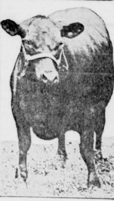
Excellent Beef Type.

The producing of baby beef has been studied with much care to determine, if possible, what are the factors