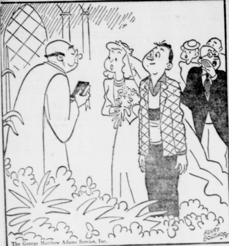
"They say all his other clothes went to the Victory Clothing Collection."