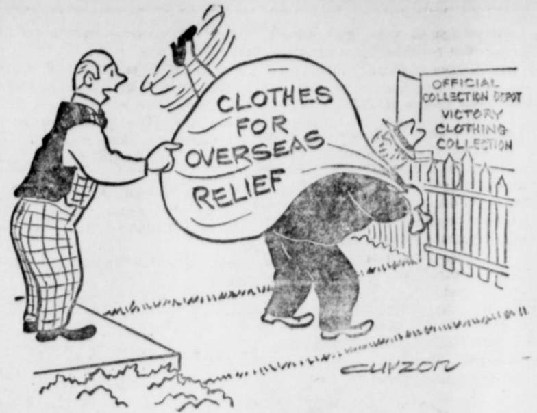
"Just a minute! One of the dresses I gave you has my wife in it."