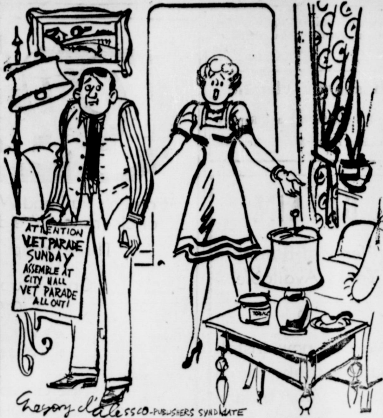
"But since the war is over I didn't think you'd need your uniform anymore—so I sent it to the Victory Clothing Collection."