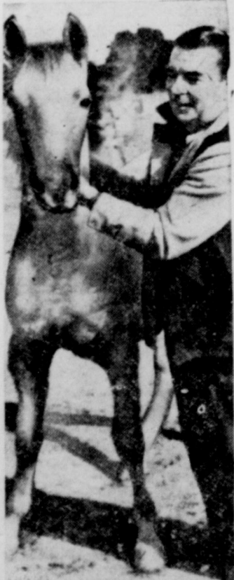
Fred Fitzsimmons agrees that Baseball Commissioner Happy Chandler's $500 fine and month's suspension made horse sense. The New York Giants' coach, you see, lives at Arcadia, Calif., which just happens to be the home of Santa Anita, the world's greatest race track.