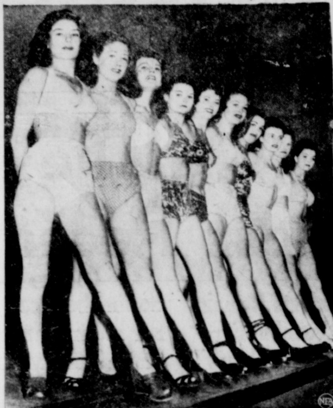
Paris isn't the only city that has a Folies Bergere, with a chorus line of scantily-clad beauties. There's a Folies in London, and these girls are trying out for the chorus. The audition was held in a London theater.