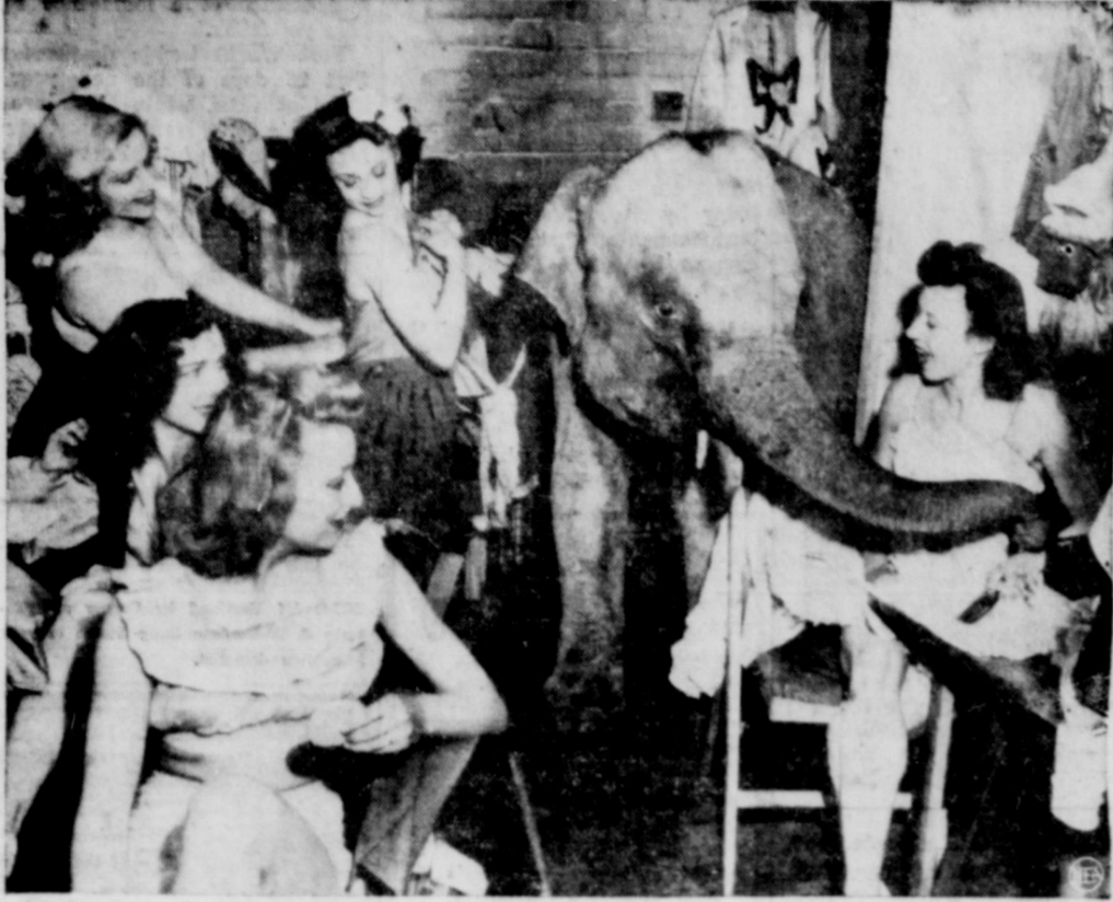
Blackie is an elephant with a little of the wolf about him. The tiny pachyderm waggles his trunk at some of the performers in the girls' dressing room at London's Harringay Arena Circus. The girls seem quite used to Blackie's crashing past the forbidden portal.