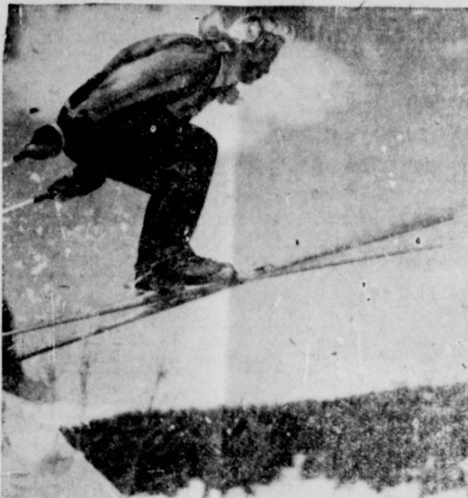
Maintaining perfect balance, a ski maiden sails into space high by the snow-capped Canadian Rockies at Banff National Park, Alberta. Executing a cornice jump, she uses her poles to give force to the leap and length to the glide on landing.