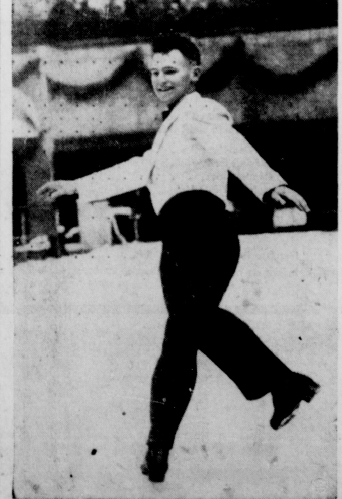
Dick Button, 19, of Engelwood, New Jersey, turned in near-flawless performance in Paris to retain his world's figure skating championship. Winner of the world's title and Olympic championship last year, he was cheered five minutes by the crowd.