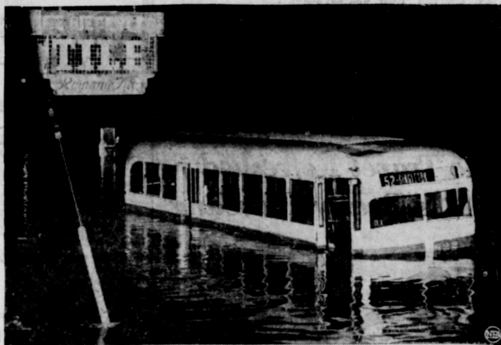
During a flash flood in Dallas, Texas, a city bus stalled in a residential community center, forcing the passengers to wade to safety. In this district, about half way between downtown Dallas and the airport, storm sewers filled and drainage waters backed up to flood the streets