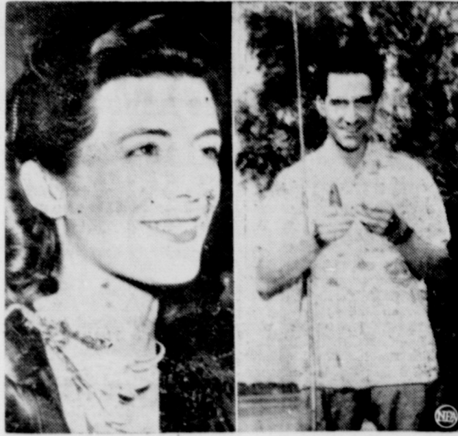
Sarah Churchill, left, actress daughter of Britain's wartime Minister, has announced she will wed Anthony Beauchamp, British society photographer. At Sea Island, Georgia, Mr. Beauchamp, right, decides to do a bit of fishing before the wedding ceremony.