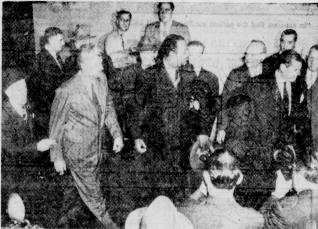
The flood-stricken area of Guatemala City where a reported 4,000 were killed and 100,000 made homeless is searched by military personnel for missing bodies. Homes were demolished by the onrushing waters following torrential rains.