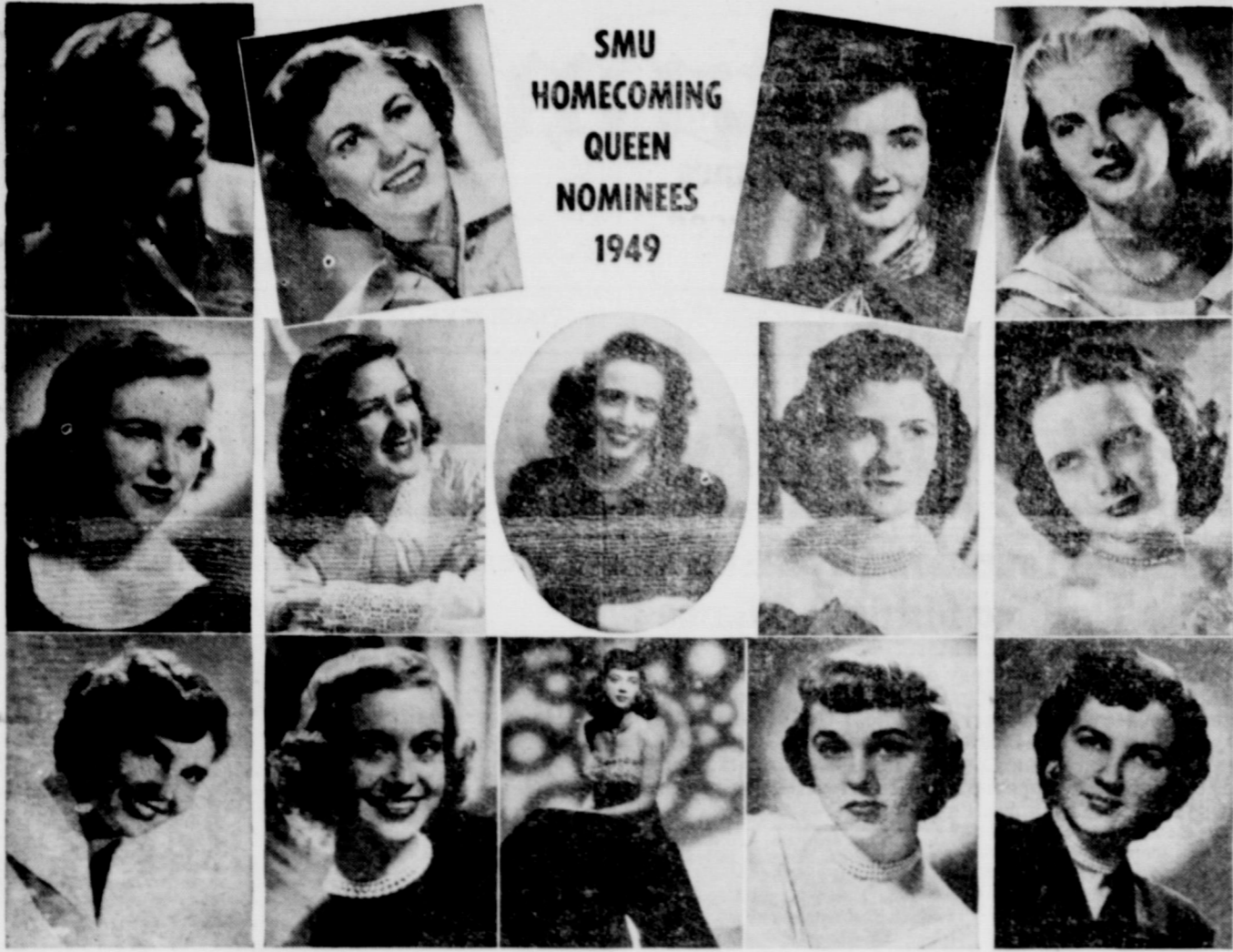
SMU HOMECOMING QUEEN NOMINEES 1949