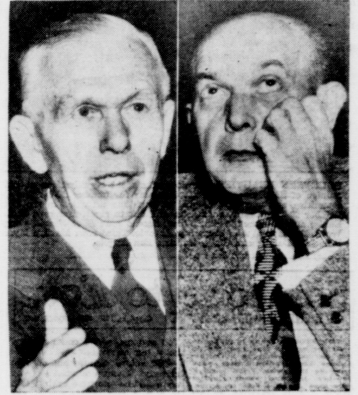
At left, General George C. Marshall, war-time Army Chief of Staff and former Secretary of States, as he appealed for unity in the Armed Forces before a House Armed Services Committee. At right, Secretary of Defense Louis A. Johnson as he told the committee that, contrary to Navy testimony, he killed the Navy's super carrier project after a lengthy study and with full approval of President Truman.