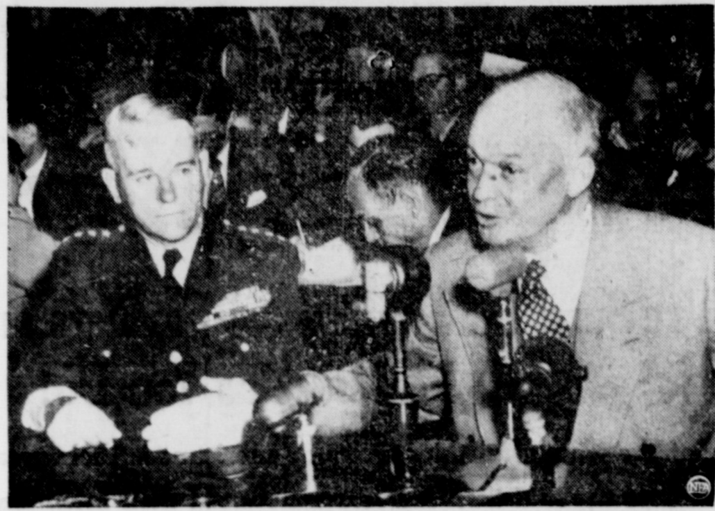
Former Army Chief of Staff General Dwight D. Eisenhower, right, testifying before the Armed Services Committee in Washington, tells the committee he believes unification can work. He said differences of opinion were bound to occur and that "we're expecting perfection too quickly." Seated at left is General J. Lawton Collins, Army Chief of Staff.

City Conference Dallas Woodrow Wilson 7, Dallas Forest 6. Fort Worth Arlington Heights 7, Fort Worth Poly 6. Houston San Jacinto 14, Houston Milby 7. San Antonio Brackenridge 45, Alamo Heights 0. Other Results Dalhart 39, Phillips 20. Hereford 22, Perryton 0. Canyon 27, Dumas 13. Panhandle 20, Wheeler 20, (tie) Claude 48, Stinnett 0. Clarendon 0, Shamrock 0 (tie). Turkey 20, Happy 6. Silverton 27, Lakeview 13. Price College 18, Childress B 6. White Face 26, Plains 0. Wellington 35, Memphis 20. Quitaque 19, Estelline 6. Muleshoe 38, Sundown 13. Abernathy 25, Paducah 13. Floydada 12, Matador 12 (tie). Olton 40, Farwell 6. New Deal 38, Ropesville 19. Springlake 39, Hale Center 6. Post 13, Snyder 7. Ralls 12, Lockney 6. Cpur 27, Crosbyton 13. Lefors 20, Tulia 12. Sudan 32, Morton 13. Groom 13, Spearman 13 (tie). Canadian 12, Vega 6. Friona 18, Whitharral 6. Andrews 19, Monahans 14. Wink 39, McCarney 6. Fort Stockton 32, Denver City 12. Crane 14, Iecos 6. Marfa 52, Clint 6. Sonora 7, Eldorado 0. Alpine 39, Fort Hancock 7. Iraan 53, Sanderson 0. Rochelle 18, Eden 15. Robert Lee 26, Lorraine 0. Rotan 21, Rago 14. Albany 39, Anson 6. Colorado City 51, Roby 7. Stamford 18, Munday 6. Wylie 27, Strawn 0. Baird 20, Moran 16.