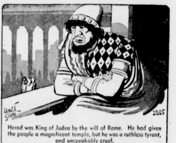
Herod was King of Judea by the will of Rome. He had given the people a magnificent temple, but he was a ruthless tyrant, and unspeakably cruel.