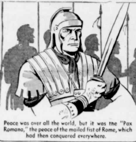
Peace was over all the world, but it was the "Pax Romana," the peace of the mailed fist of Rome, which had then conquered everywhere.