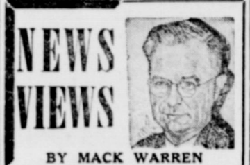
BY MACK WARREN

The American Shorthorn Breeders' Association reports an increase of 12 per cent in Short-