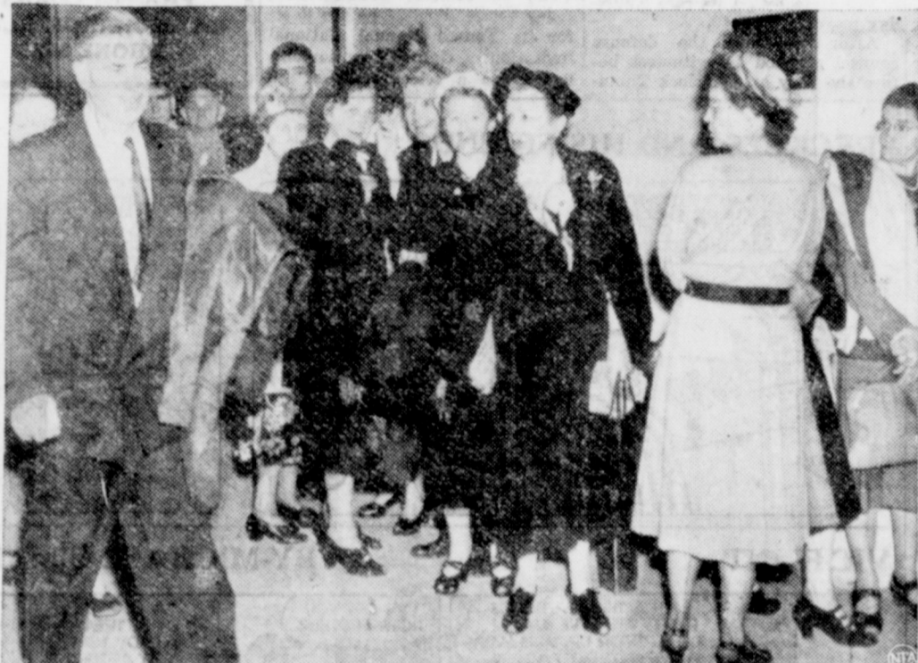
Women spectators line up outside the House UnAmerican Activities Committee hearing room in Washington for a glimpse of Henry A. Wallace, former Vice President, as he arrived to testify. Wallace told the committee that he had nothing to do with wartime atomic shipments to Russia and didn't even know they were made.