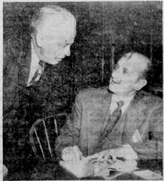
David E. Lilienthal, right, who steps out as Chairman of the Atomic Energy Commission, talks with Sumner Pike, vice - chairman, who will take over Lilienthal's duties. Some time later President Truman will appoint a successor to Lilienthal.