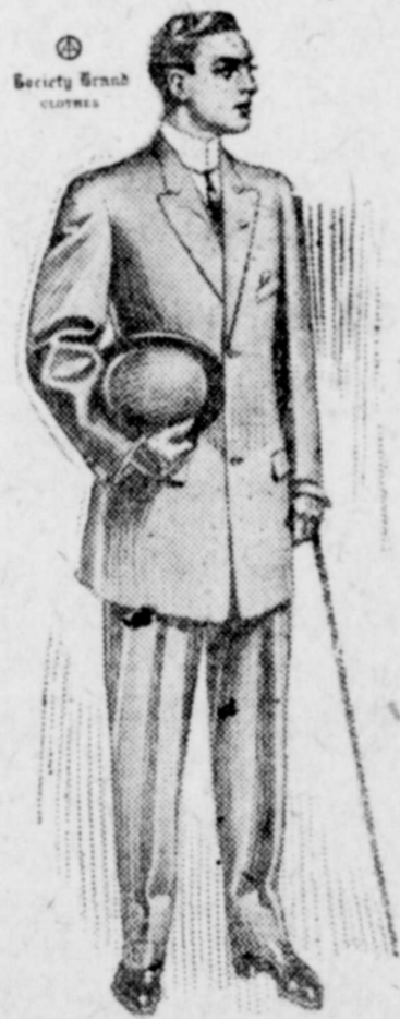
Abilene, Texas 146 Pine St.

Saturday Evening Post at McClains Drug Store.