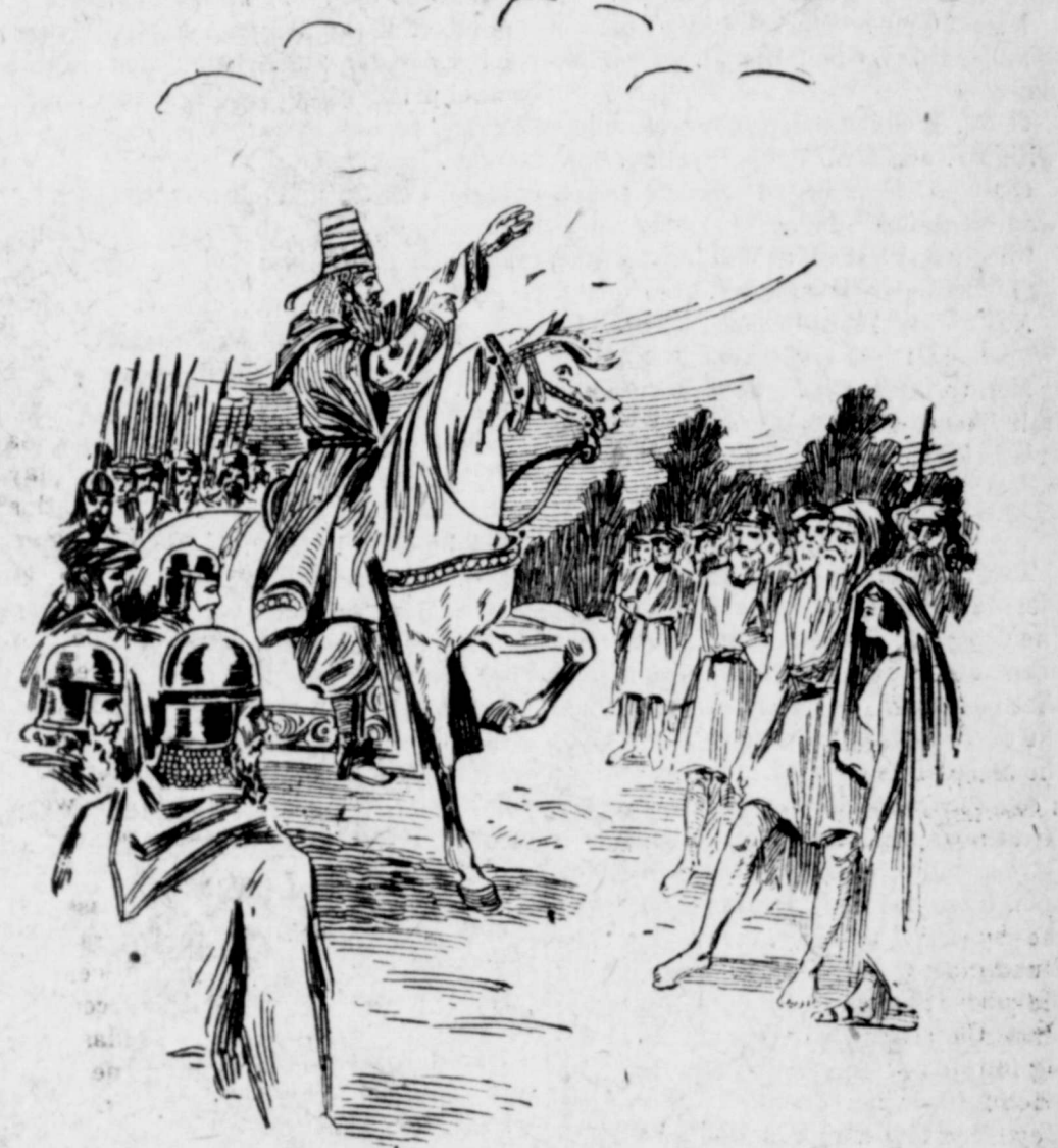
CYRUS THE GREAT ORGANIZING GOVERNMENT.

CYRUS THE GREAT founded the Persian Empire and exercised absolute power over a larger number of people than any other human. From a wandering horde he organized a vast wave of human power and grandeur which swelled and rolled on in undiminished magnitude and glory for many centuries. This powerful man was able to lift the soul of humanity into the heights of reason and by his compelling and persuasive power lead them into higher altitudes of civilization. No event of importance in the human race was ever accomplished without the guiding hand of a spirit of great power.