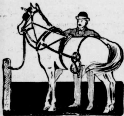
Figure With Us

are the kind you want for both your work stock and your buggy horse. WE KNOW WHAT WE put into our harness and know they are good.