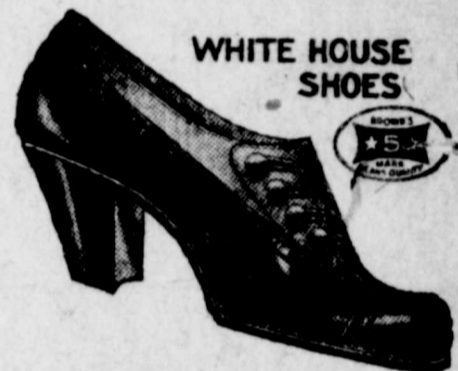
WHITE HOUSE SHOES