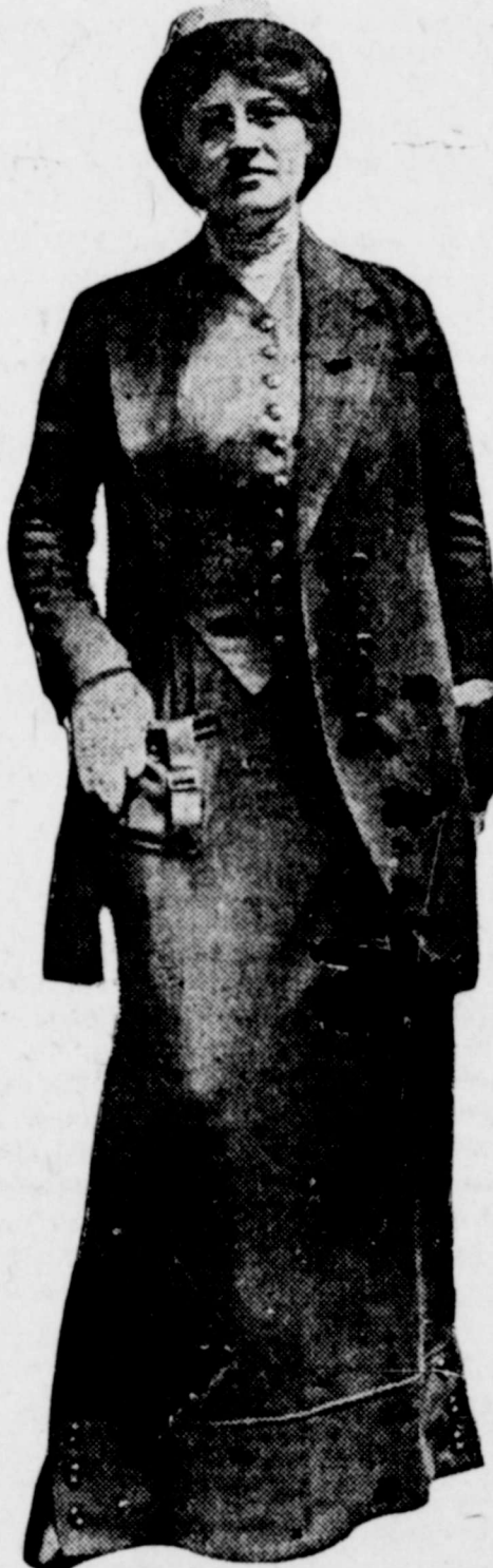
The Chicago policewoman, soon to be a feature of Chicago life, will wear a natty and stylish uniform, and the one shown here in the illustration is chosen for her. A significant feature of the skirt is a pistol pocket on the right side.

***** * THIS IS THE COSTUME FOR * * CHICAGO POLICEWOMEN * *****