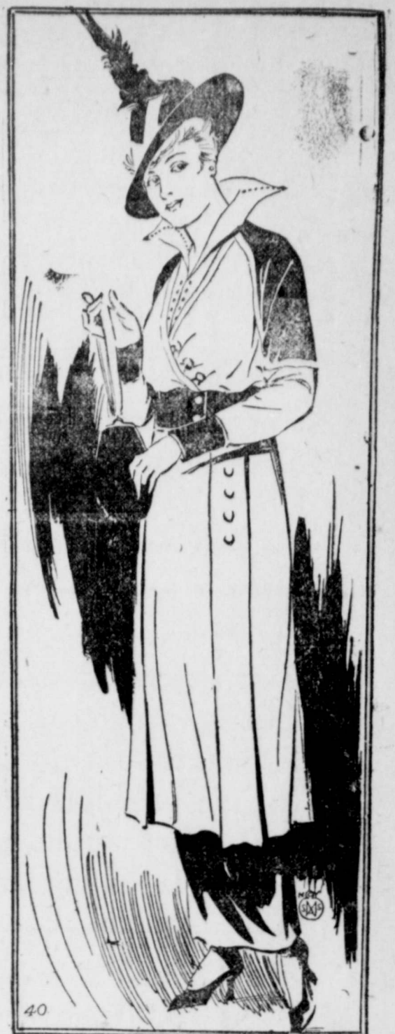
$25 SUIT $17.50