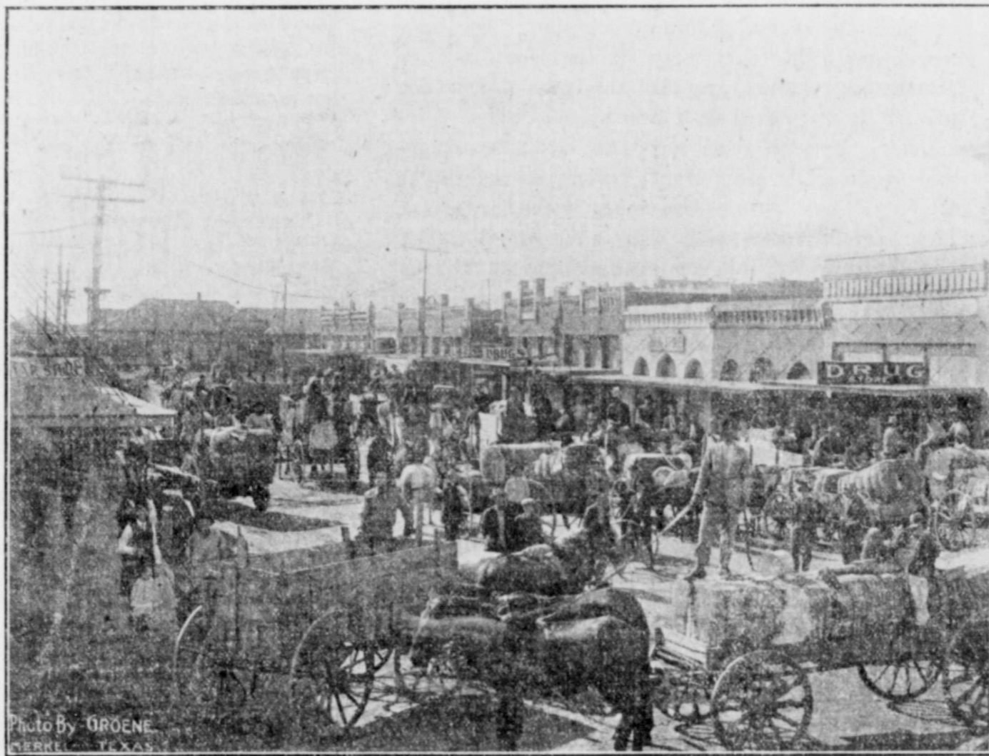
Looking down Edwards street in Merkel, Saturday, November 21, 1914, probably the busiest day of our cotton season. Over 600 bales of cotton were paid for by our two banks during the day and approximately 750 bales brought here from four o'clock in the morning until past midnight of the same day.

On Thursday evenings, December 31, at the Methodist Church