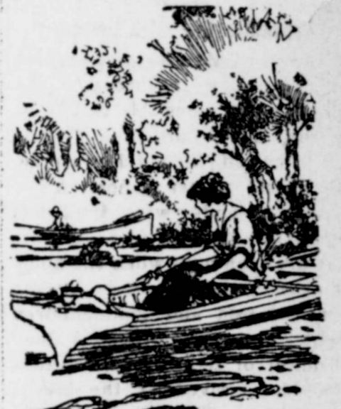
"Right Where I Wanted to Anchor."

"The fish?" "The man. Right in the spot where I wanted to anchor swung his boat. I thought he was a native because of the old straw hat till he turned, and it