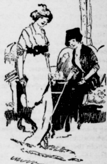
"I Think I Shall Lose My Mind."

"He did call to see me before he went back to New York—and arrived when our living room was full of some ancient relatives, whom we