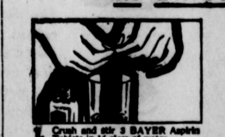
1. Crush and stir 3 BAYER Aspirin Tablets in 1/2 glass of water.