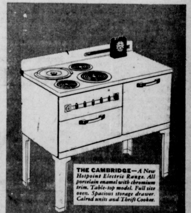
THE CAMBRIDGE—A New Hotpoint Electric Range. All porcelain enamel with chromium trim. Table-top model. Full size oven. Spacious storage drawer. Calrod units and Thrift Cooker.

Economical. Uses only about as much current as the kitchen light. Cooks an entire meal of meat, vegetables, dessert—or bakes small quantities, like a few potatoes, without need for heating up the oven.