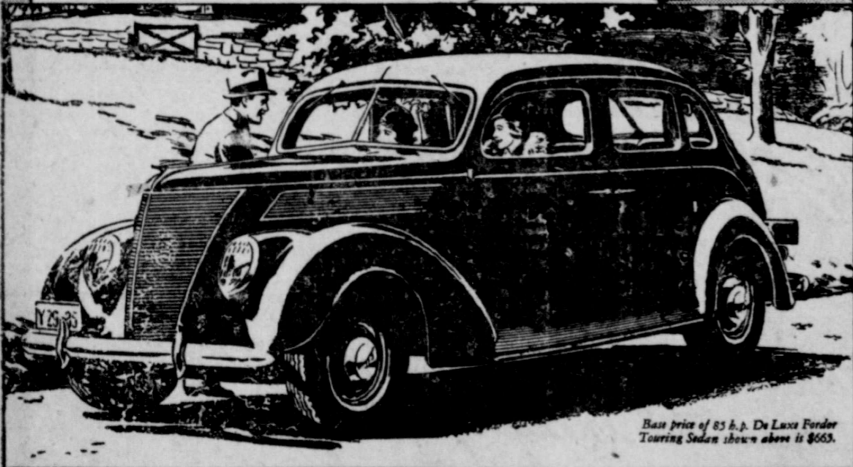
Base price of 35 h.p. De Luxe Ford Touring Sedan shown above is $665.

The 1937 Ford V-8's are here... with sweeping improvements that mean finer performance, more comfort, and economy. Call on us today... See and drive America's most modern low-priced cars! YOUR FORD DEALER