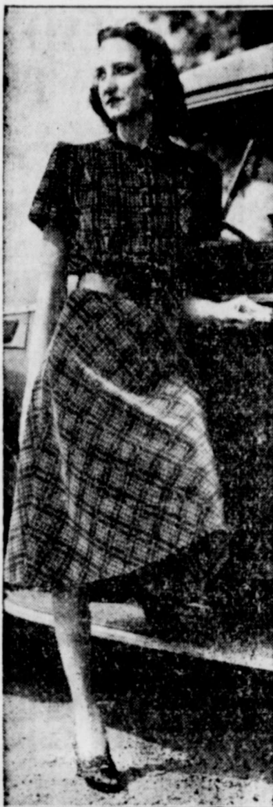
Cotton velveteen in colorful printed patterns is a practical and warm fabric for fall and winter dresses. The seams of this dress are pinked to keep them as flat as possible. Bias pockets and skirt emphasize the plaid of the material.