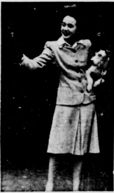
Spring suits, this year, according to the February Good Housekeeping are something to dream about. The pages of the magazine offer this one of wool gabardine which features a fetching box's coat.