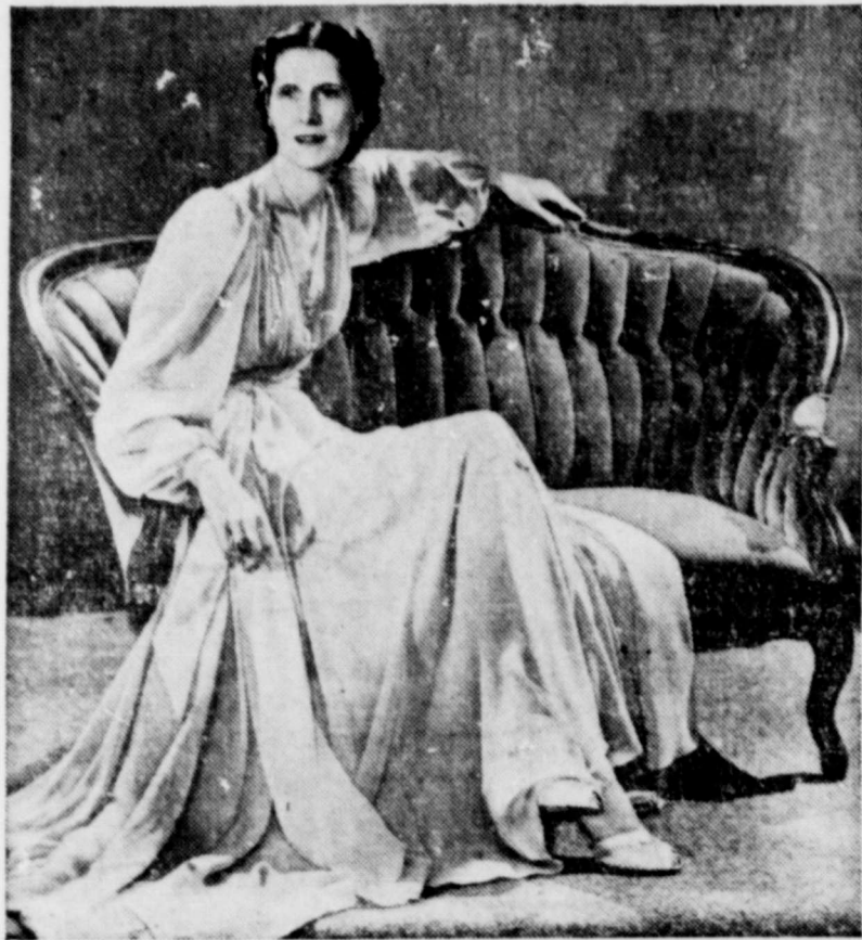
A perfect figure, says the February issue of Good Housekeeping, is not an essential of high fashion. This woman, obviously too tall and thin, has chosen a beguiling feminine evening dress with full, draped bodice, flowing skirt. Loose sleeves, she says, make a thin woman look young and rounded.