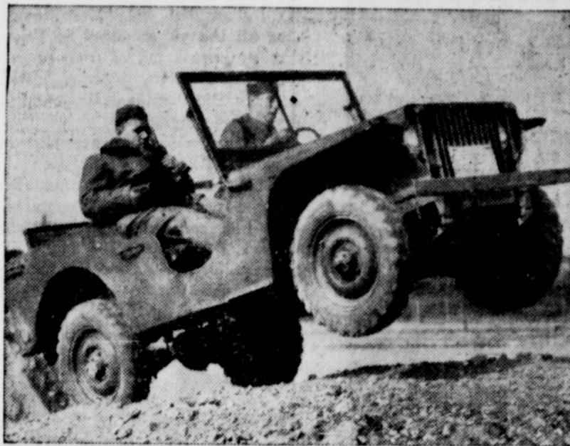
Speed shot at Camp Holabird, Maryland, during tests on new Light Reconnaissance and Command Cars for United States army. They carry machine gun and crew of three men at approximately 60 miles an hour. Can climb steeper hills than tanks. The Ford Motor Company, which built the ditch-jumper shown above, has an army order for 1500 of these units.