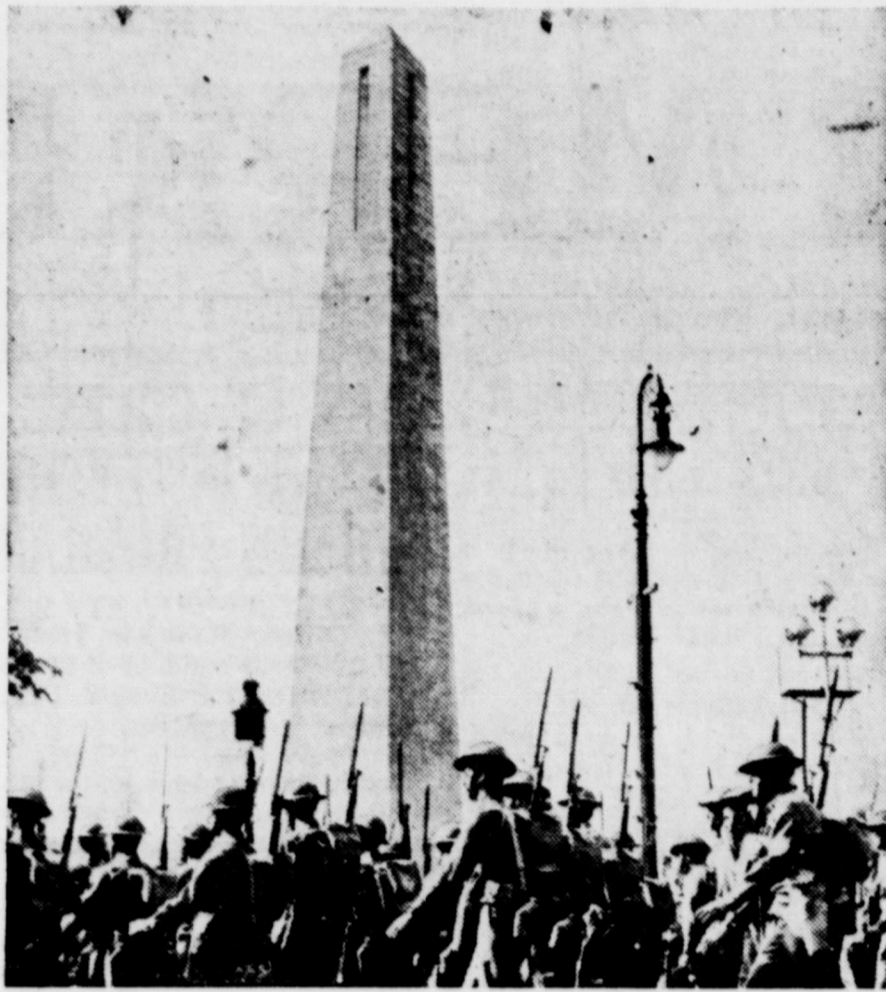
The 182nd infantry, Yankee division, from Camp Edwards, Cape Cod, march snappily at the foot of Bunker Hill monument, Charlestown, Mass., in 166th celebration of the famous battle fought with the British.