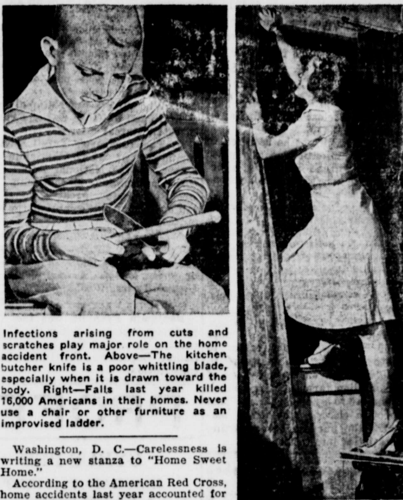
Infections arising from cuts and scratches play major role on the home accident front. Above—The kitchen butcher knife is a poor whittling blade, especially when it is drawn toward the body. Right—Falls last year killed 15,000 Americans in their homes. Never use a chair or other furniture as an improvised ladder.

Washington, D. C.—Carelessness is writing a new stanza to "Home Sweet Home."