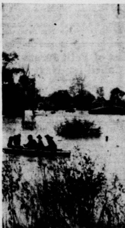
A rescue party in a rowboat travels down a city street which is under five feet of water. The flood was caused by the Arkansas river, which broke out of its banks at Tulsa, leaving scores of families homeless and causing great damage.