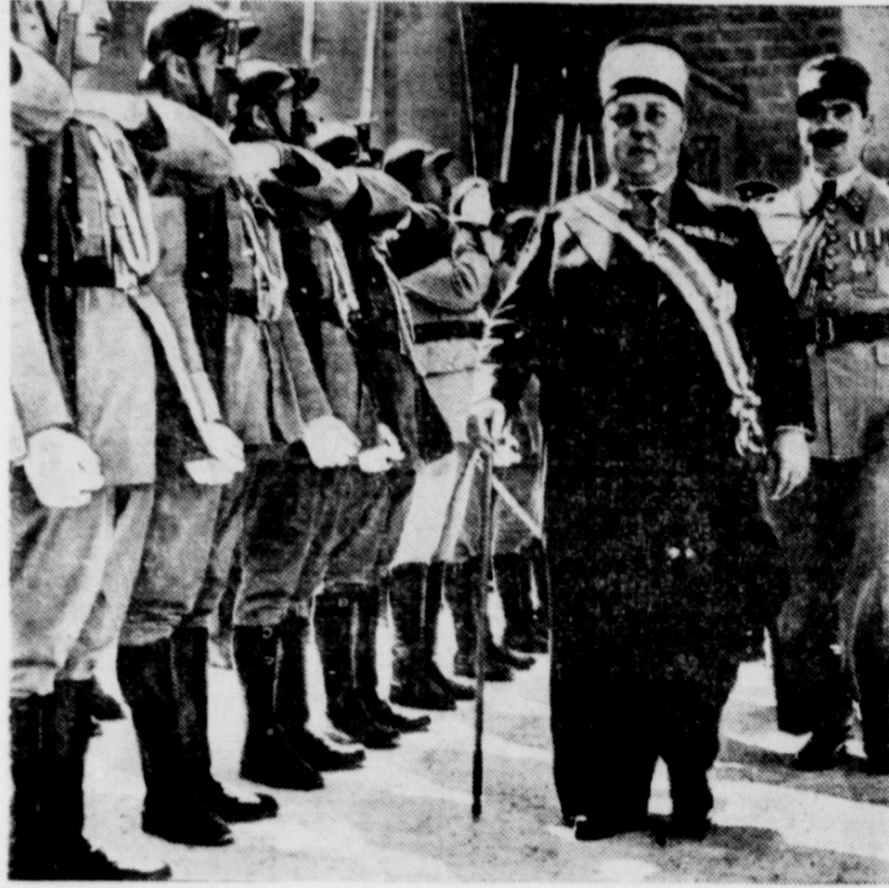
Cheikh Taggadine, the new president of Syria, inspects a guard of honor of Free French troops outside the town hall at Damascus, Syria. Syria was granted her independence when Free French General Catroux formally handed the country over in a broadcast speech from Damascus.