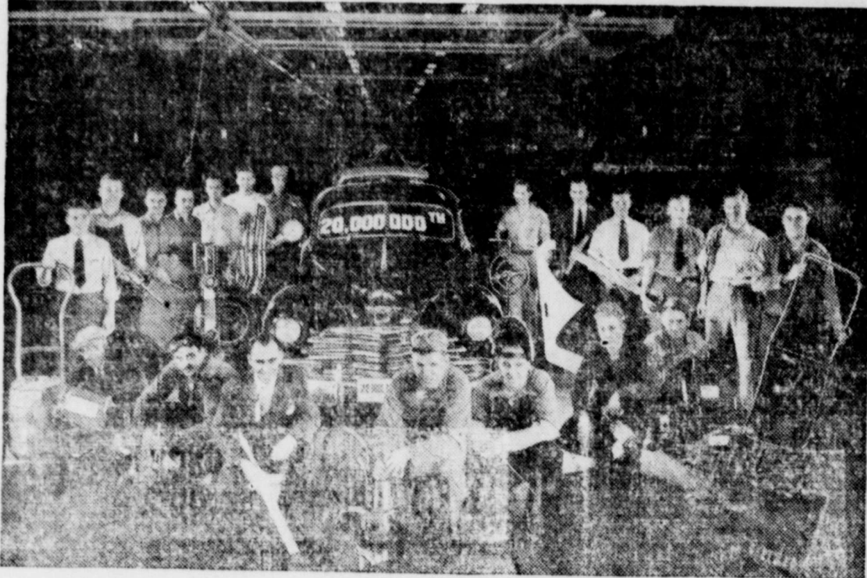
Twenty men whose combined crafts and skills are representative of the myriad trades contributing to production of a motor vehicle, pose at Flint, Mich., with a "milestone model"—the 20,000,000th unit produced by Chevrolet in its 35-year history. From the engineer with his designs and blueprints, to the polisher with his buffing tool, from the chemist to the hooded welder, these are the men who keep the nation's traffic arteries humming. Despite production difficulties, Chevrolet has produced its latest million cars and trucks in almost exactly a year.