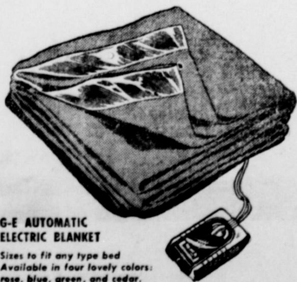
G-E AUTOMATIC ELECTRIC BLANKET

It's a simple, inexpensive way to better sleep, better work, better health. It lasts for years. It is as easy to launder as any blanket... Sleep under one once and you'll never be without it.