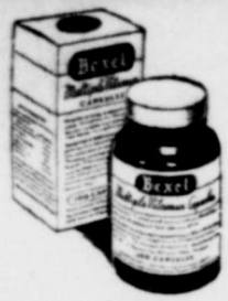
Merkel Drug Company